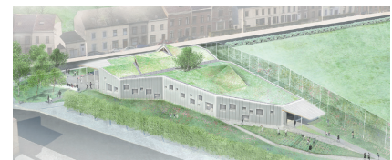
↑ Grass will cover the undulating roof. ↓ Situation